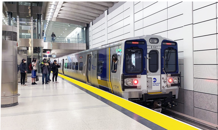
LIRR trains arrives Grand Central via the East Side Access.