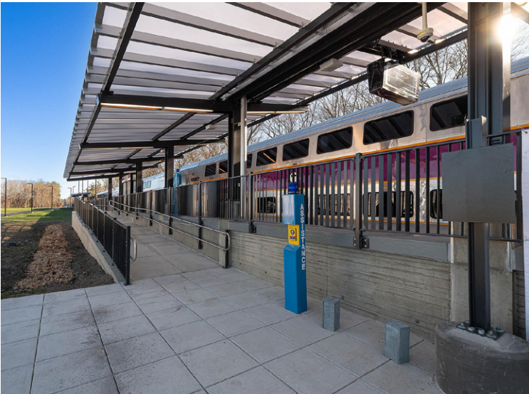
Freetown Station on the South Coast Rail Project.

Parts of the St. Lawrence and Atlantic Railroad received significant track rehabilitation due to $9.6M in FRA funding, along with a match from the states of Maine, New Hampshire, and Vermont, as