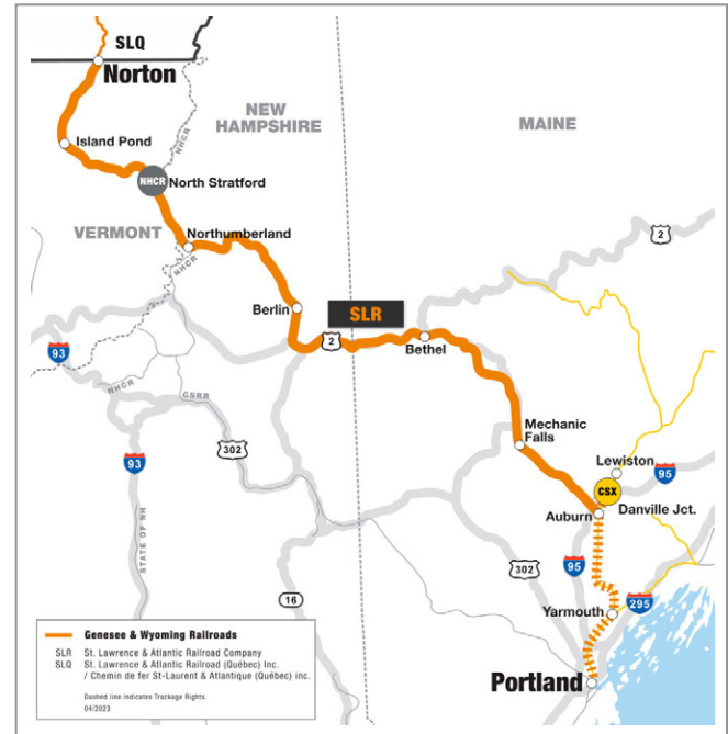
St. Lawrence & Atlantic map. Genesee & Wyoming RR

The New England Railroad scene looks bright, and 2024 is another landmark year. With so many changes in 2023 and a promising outlook for 2024, the New England Railroad Club and all our members are proud to be part of the New Year.